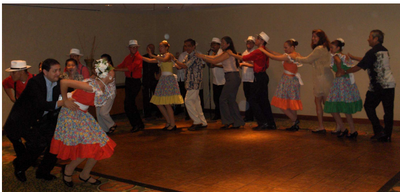
Folkloric Dancers with ITMIC 2009 participants on the Dance Floor