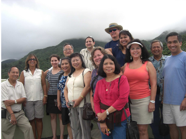
Some of the attendees at the El Yunque National Rainforest